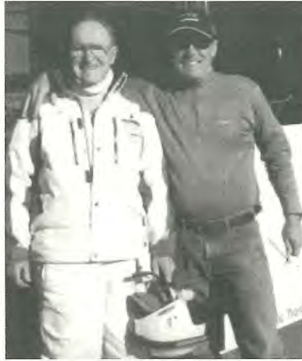
From the Mountain Rides Bulletin January, 2012